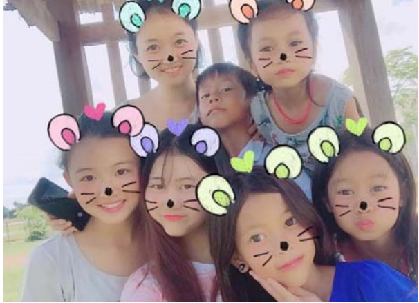
Making fun memories together; so much in common